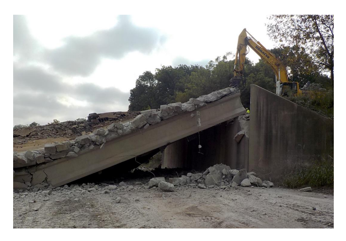
Photo of mechanical demolition/removal of an existing interchange concrete beam single span bridge that was part of the old/previous SR 422 highway.