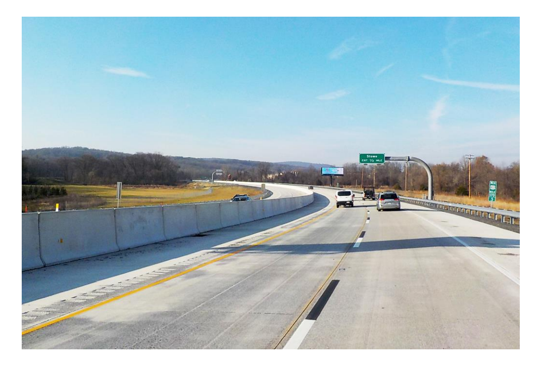
Photo on SR 422 looking westward at start of the highway realignment, where old SR 422 was removed to provide an open flood plain along the Schuylkill River.