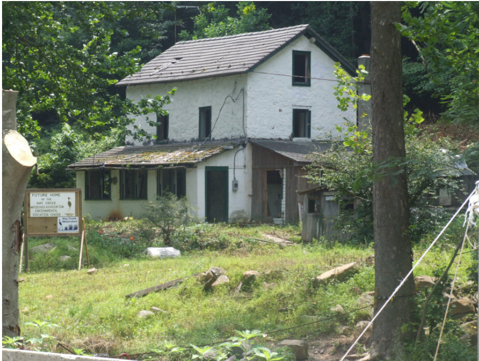
The current state of the Millard house – soon to be the HCWA Environmental Education Center